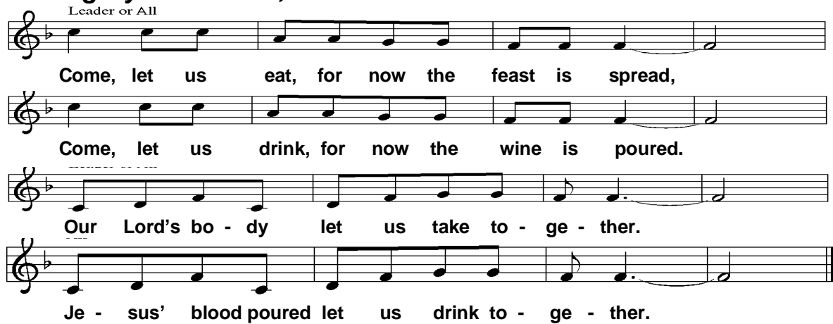
Table Setting Hymn: "Come, Let Us Eat"