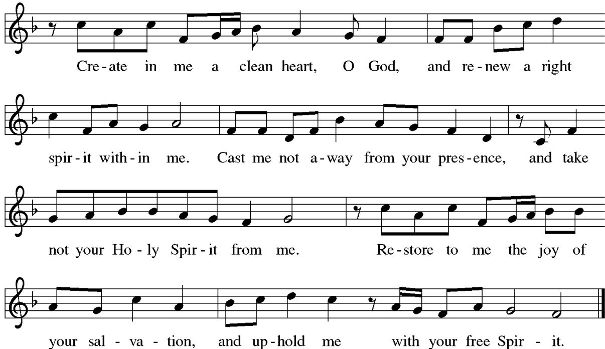
Table Setting Hymn: "Create in Me a Clean Heart"

Extravagant God, you have blessed us with the fullness of creation. Now we gather at your feast where you offer us the food which satisfies. Take and use what we offer here, come among us, and feed us with the body and blood of Christ, in whose name we pray. Amen.