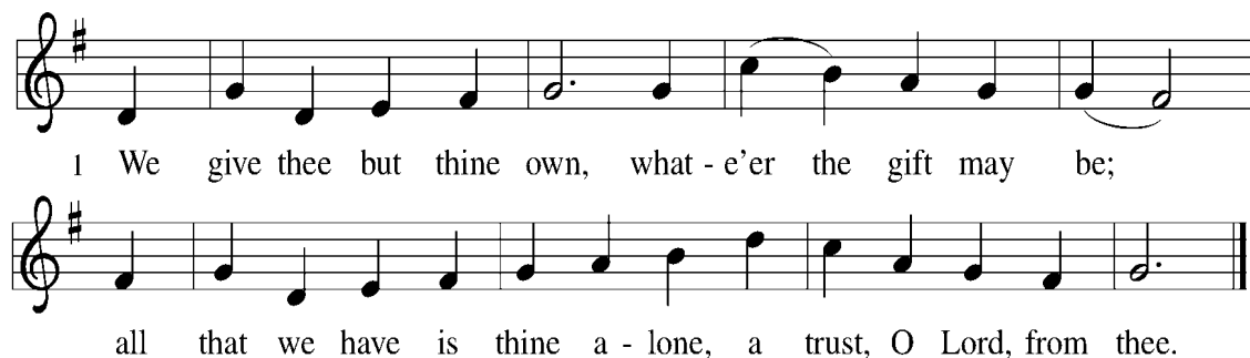
Table Setting Hymn: ELW #686 "We Give Thee but Thine Own"

Risen One, you call us to believe and bear fruit. May the gifts that we offer here be signs of your abiding love. Form us to be your witnesses in the world, through Jesus Christ, our true vine. Amen.