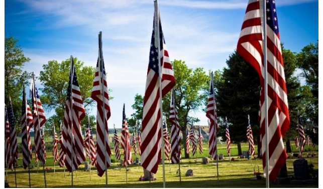
"Avenue of Flags" @ Park City Cemetery